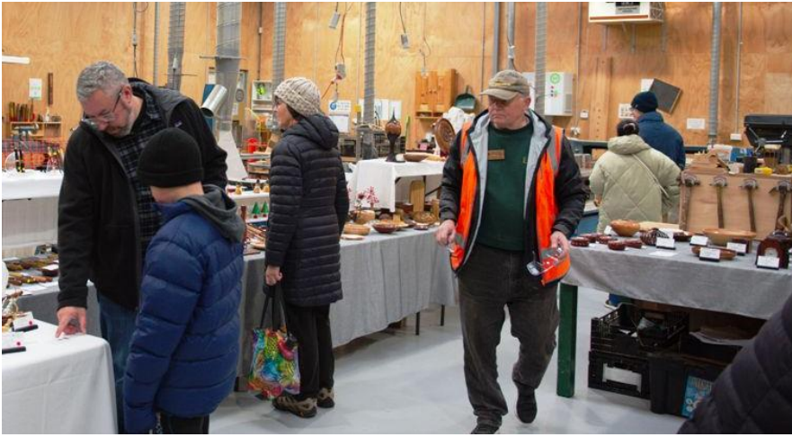
The sales tables pictured here, attracted a lot of attention, as did the chain saw carver. That's the result of the carving seen below - a pair of echidnas. The rides for the children were also very popular. (below left.)