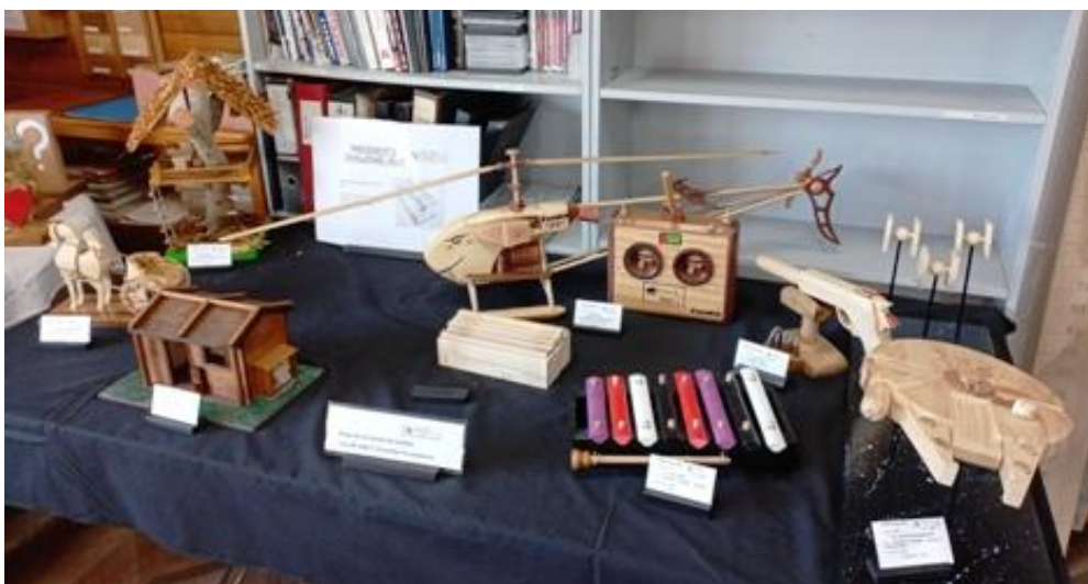
President's Challenge entries as displayed at the Expo.

On the last page, see a photo of the pieces of wood from which these marvels were made.