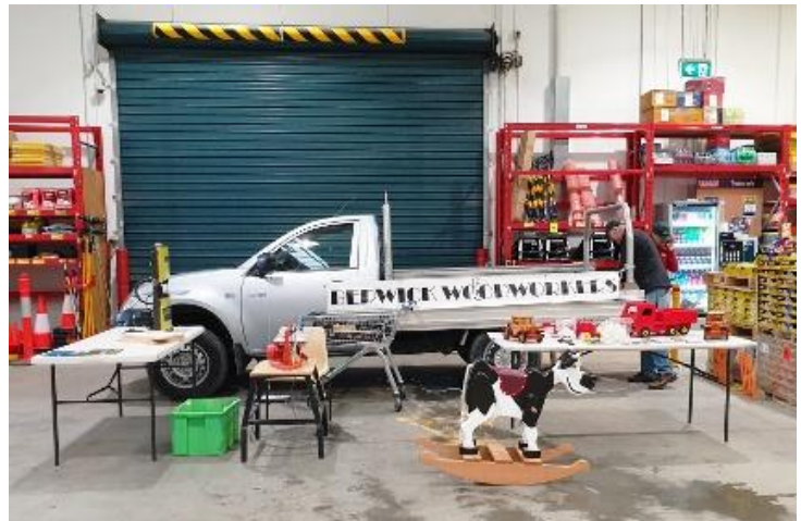
Above, setting up for the evening at Clyde North.