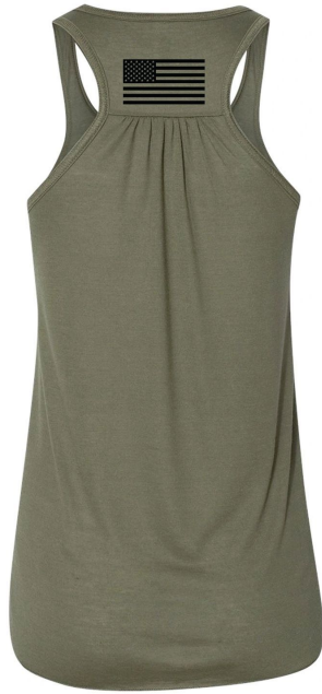
Ladies Tank Back