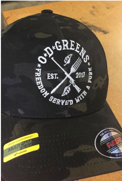
ODG Flexback Hat