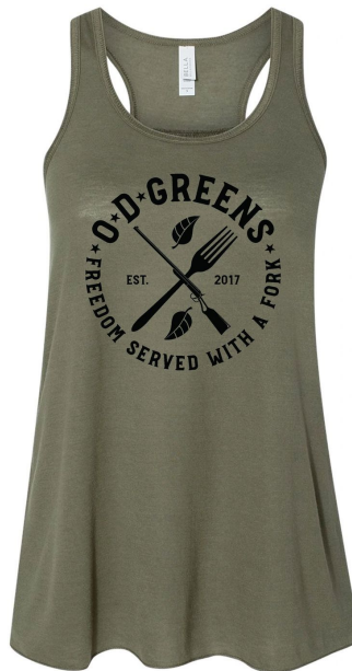
Ladies Tank Top Front