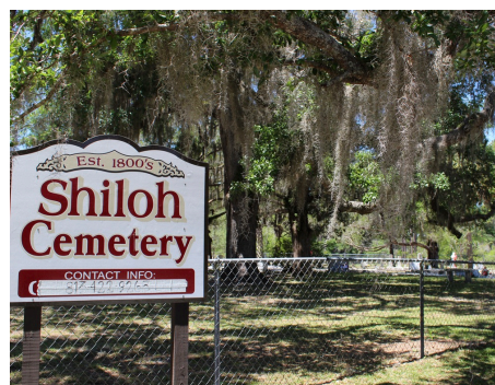
Existing Shiloh Cemetery sign at the entrance of the Ancestral Grounds. This sign was installed by Jerald Beckham in 2011. There is another like it at Highway 24 and Shiloh Road.