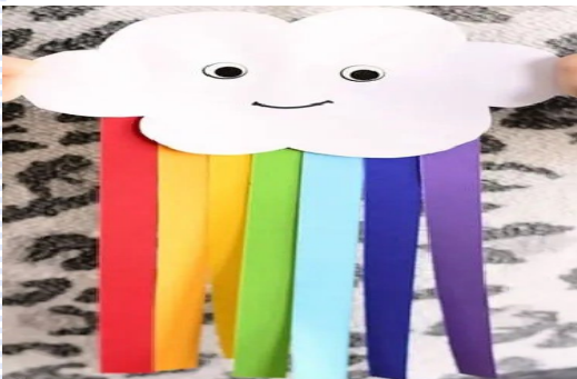
Cute Paper Rainbow Craft