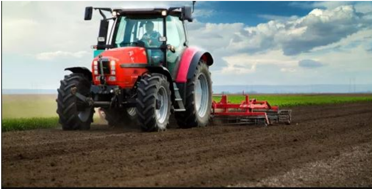
Farmringg leased tractors for their pilot project