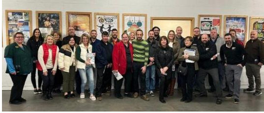
GLBMA members and guests at Bronner's CHRISTmas WONDERLAND, December 20, 2023.

Thank you to all our members and guests that took time out of their schedule to attend.