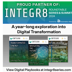
View Digital Playbooks at integr8series.com

We're not just talking theory. This playbook is packed with insights from a cross-section of professionals, actionable tips, and resources to help your workforce leverage Industry 4.0.