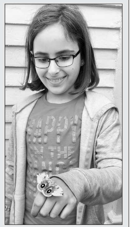
Automeris io , or the "io moth" with a wingspan of 2.5–3.5 inches, perches on an attendee's hand.

In addition to seeing beautiful photographs and learning about these often-overlooked, but amazing animals, attendees had the chance to interact with live caterpillars