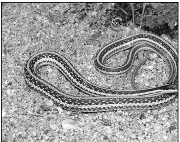
Left to right: Eastern hognose snake, northern black racer, smooth green snake, and ribbon snake.