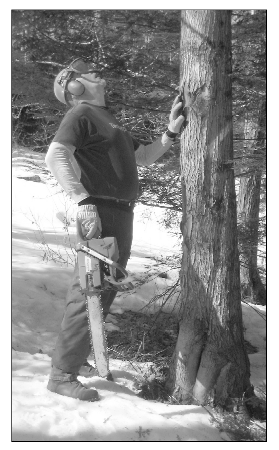
Before taking his saw to the tree, this professional logger is taking a moment to look for overhead safety issues, like dead or hung up branches and checking to see which way the tree may be naturally leaning.

harvested timber on their properties, including the Society for the Protection of NH Forests, Harris Center for Conservation Education, Piscataquog Land Conservancy, and Francestown Conservation Commission. Sometimes these organizations also host an educational event on the property where a forester or other resource professional explains the nuts and bolts of the