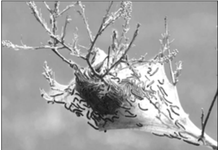
Top: A yellow-billed cuckoo. Above: tent worms.

So what was going on with cuckoos in 2020? As noted above, cuckoo abundance often varies among years, and this variation is largely due to fluctuations in prey. Cuckoos eat a wide variety of insects but