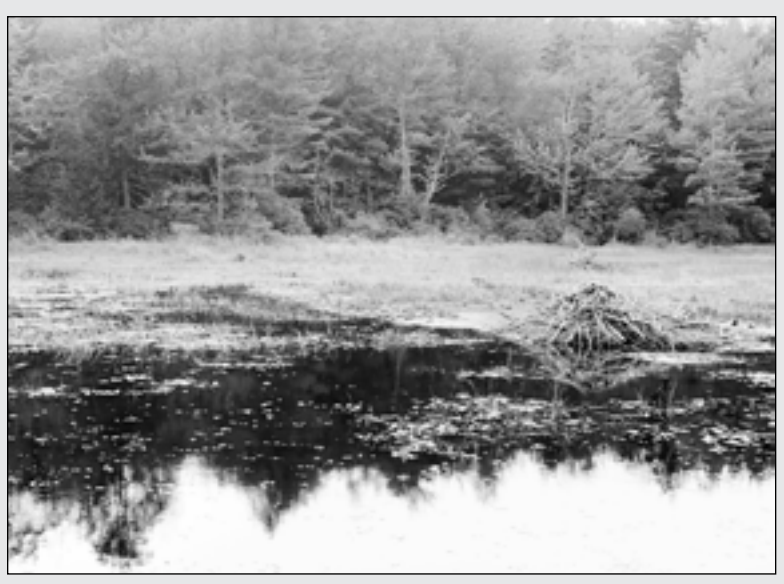
A beaver pond on the Schott Brennan Falls Reserve reflects the forest.

The trail continues along the left bank of Brennan Brook to the half-mile point, where there is a footbridge across the brook. Here the trail narrows to a single track and ends at Brennan Falls about two thirds of a mile from the