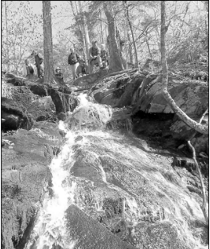
Brennan Brook Falls, during a non-drought season.

FLT's Schott Brennan Falls Reserve abuts the area and has within its borders an old dam, a cellar hole, and