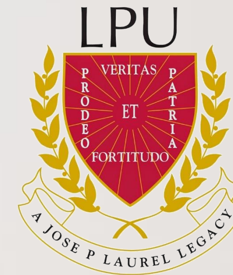
Lyceum of the Philippines 5.4 km