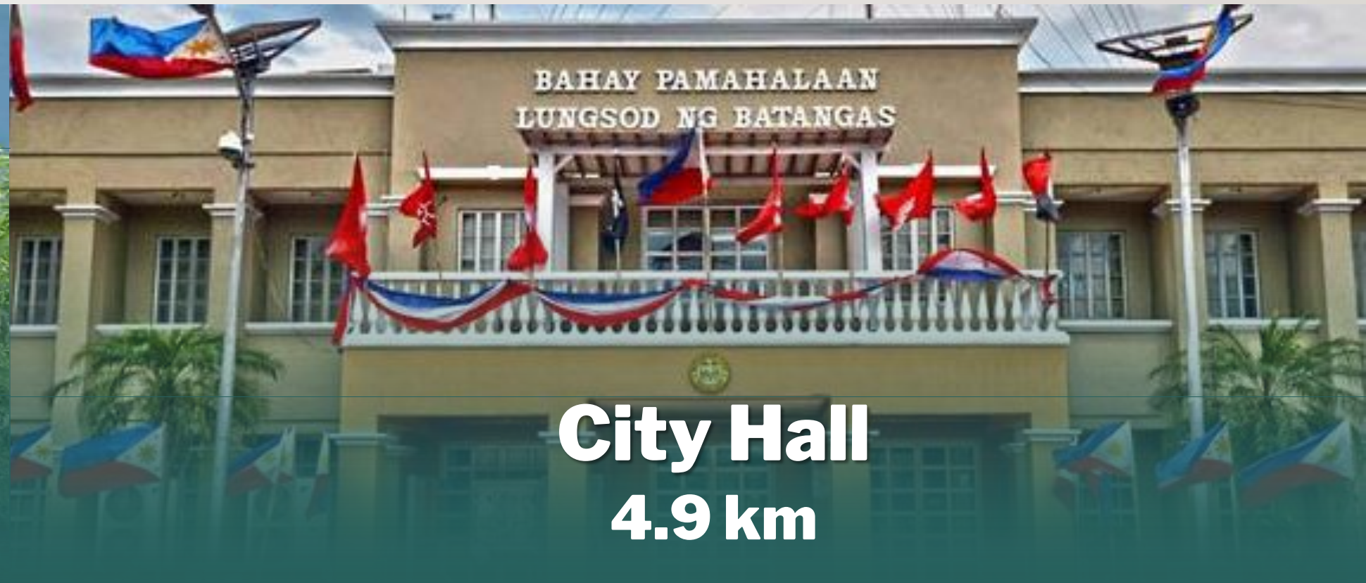
City Hall 4.9 km