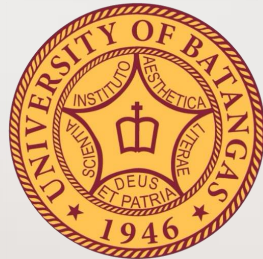
University of Batangas 6 km