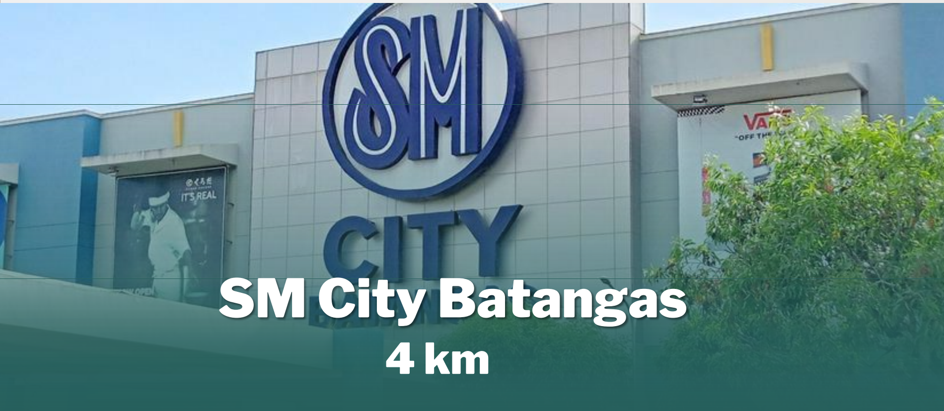
SM City Batangas 4 km