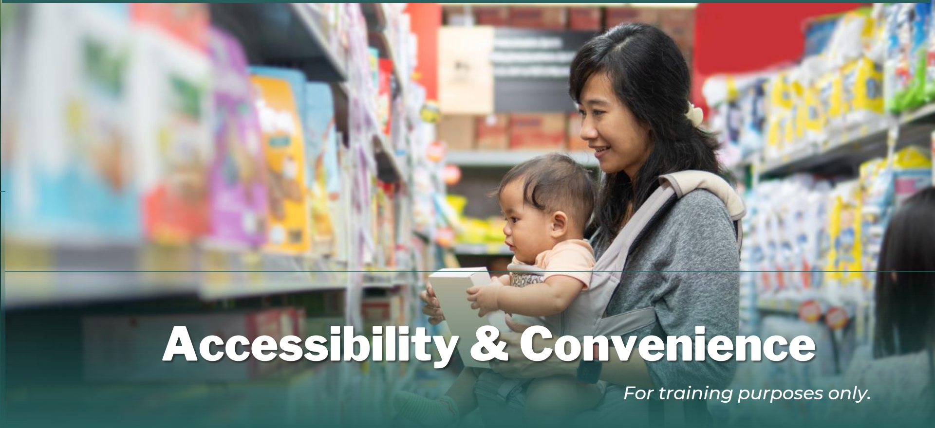
Accessibility & Convenience