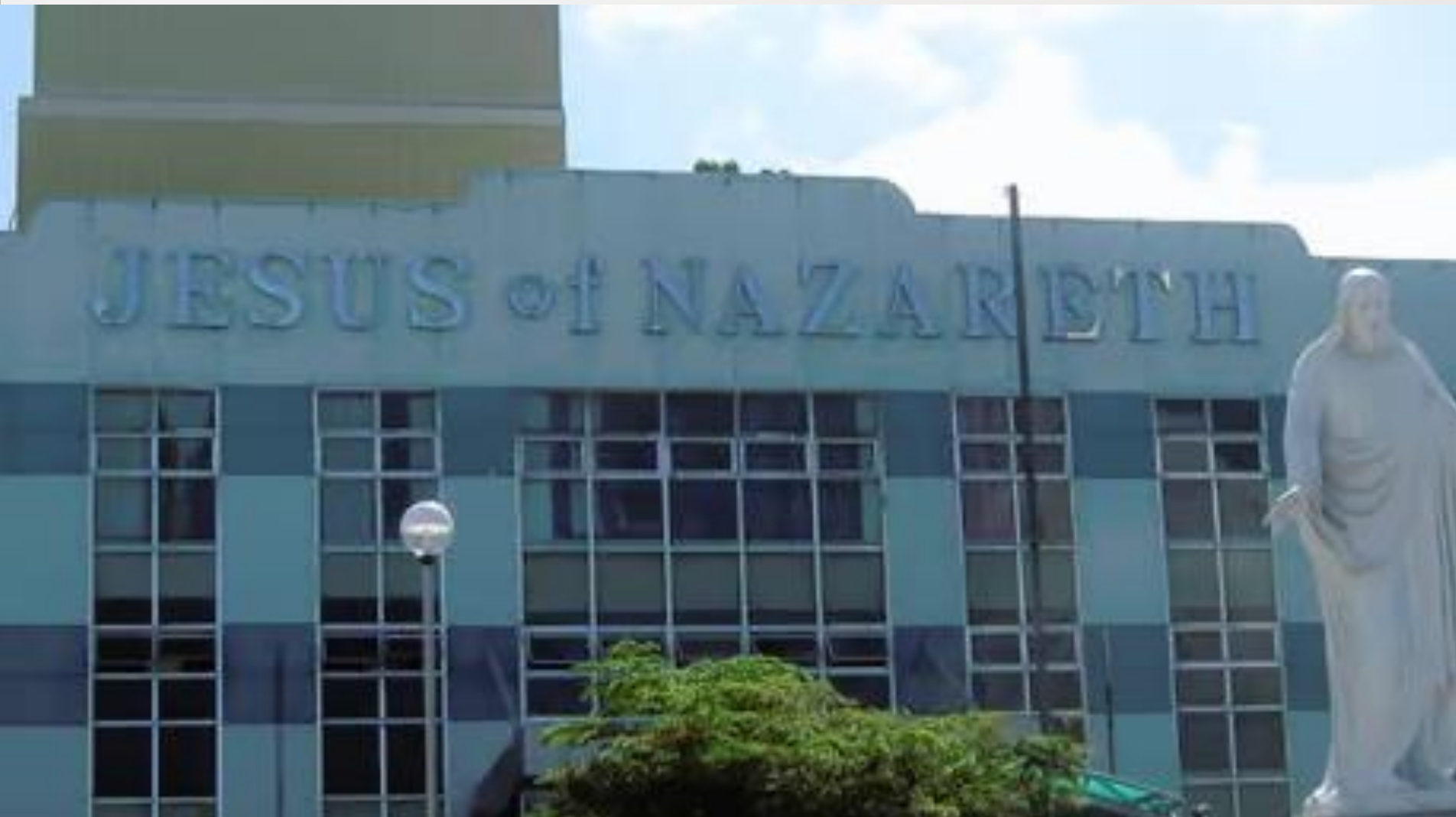
Jesus of Nazareth Medical Center