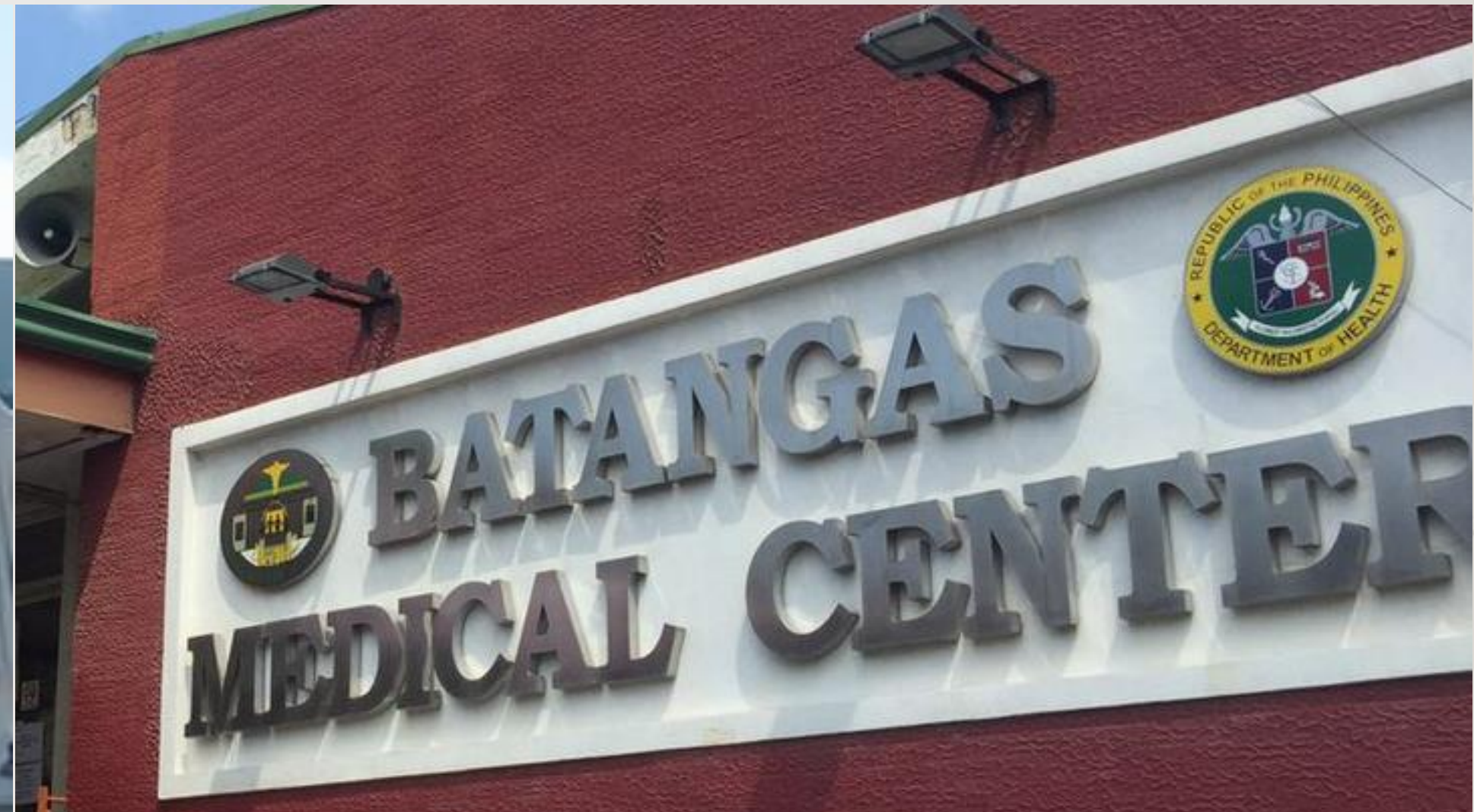
Batangas Medical Center