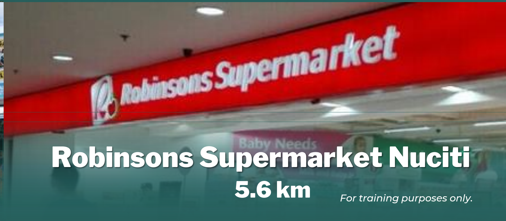
Robinsons Supermarket Nuciti 5.6 km