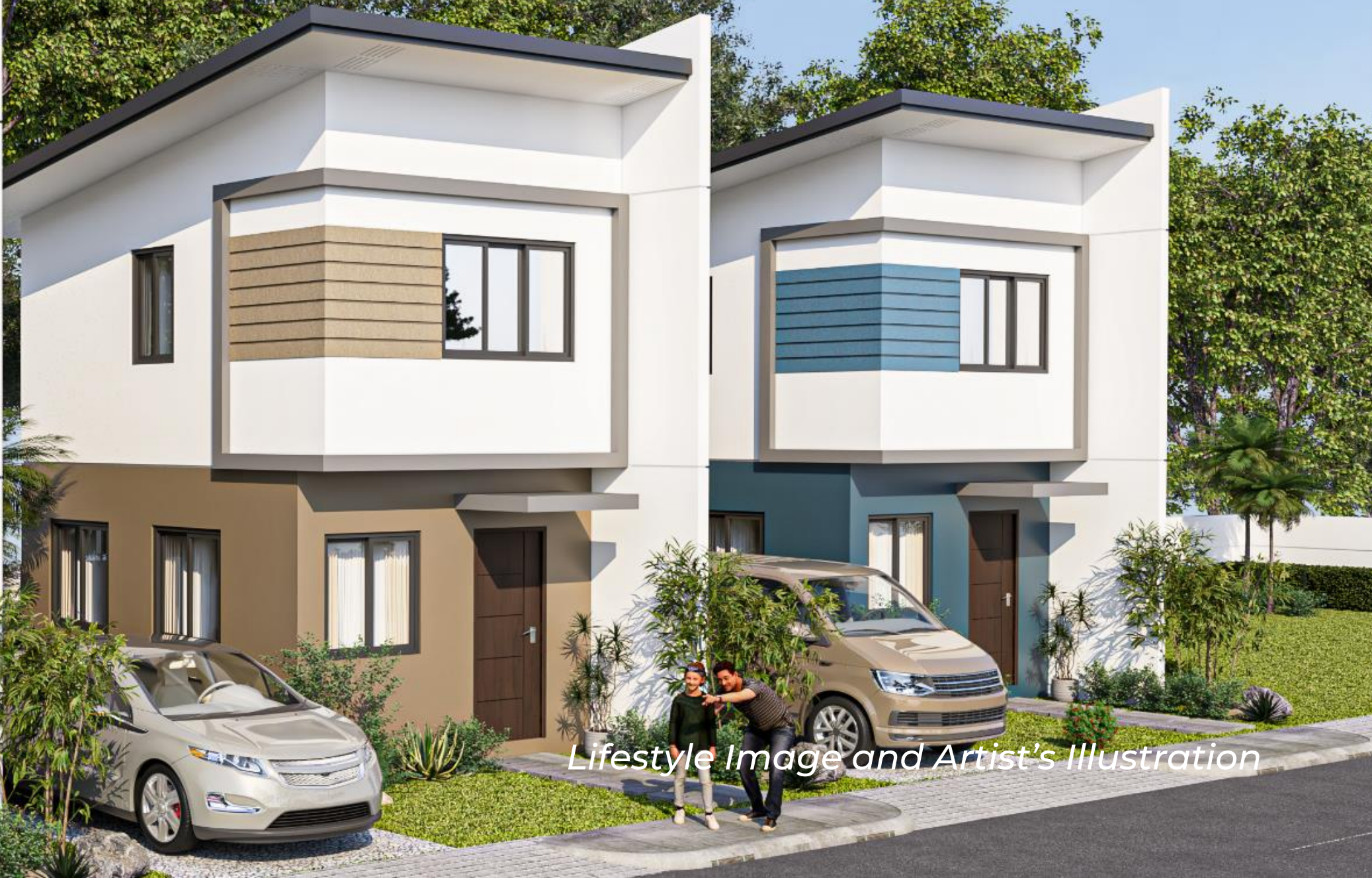
Lifestyle Image and Artist's Illustration