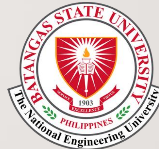
Batangas State University 6.1 km