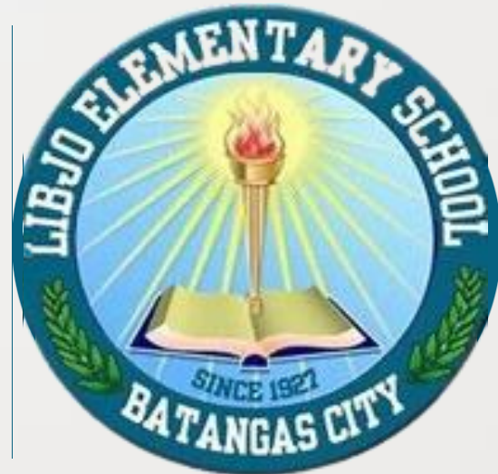
Libjo Elementary School 2.4 km