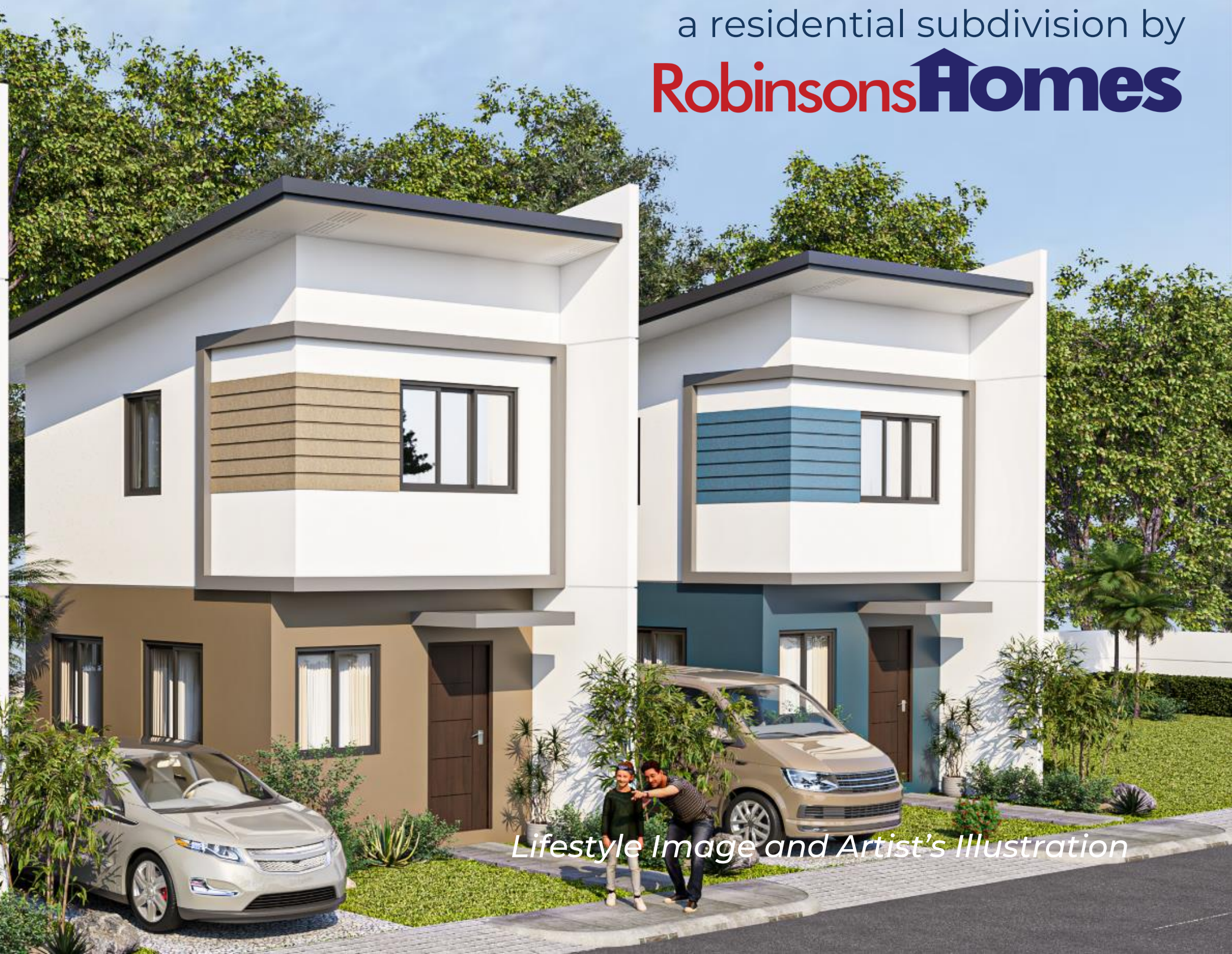
Lifestyle Image and Artist's Illustration