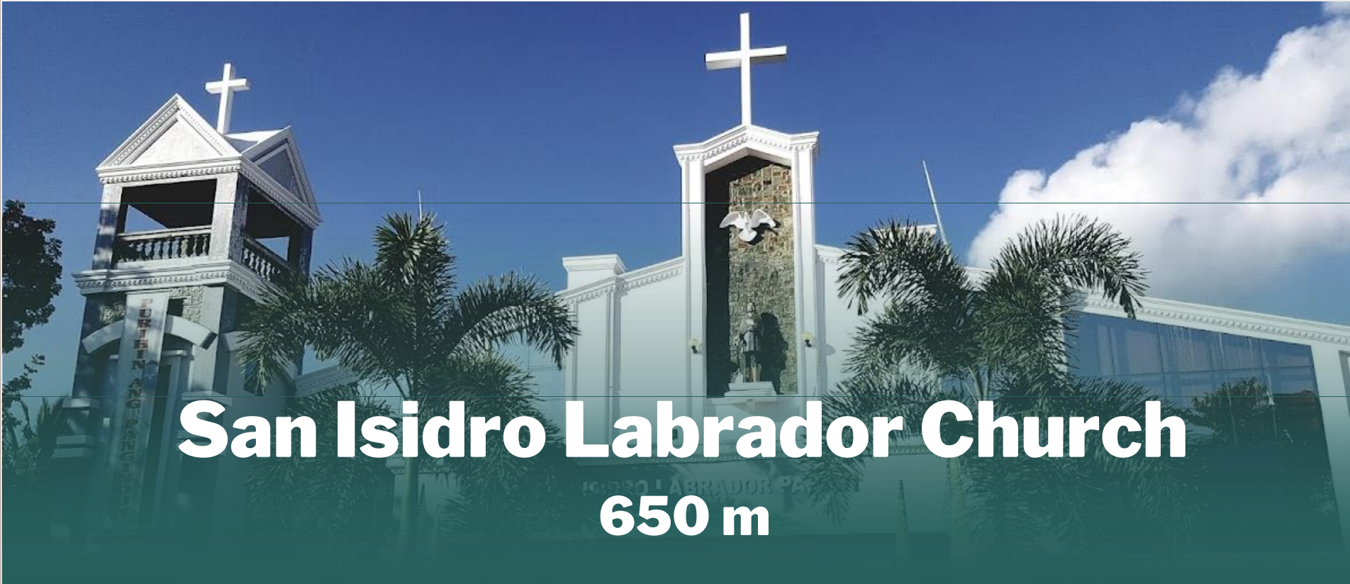
San Isidro Labrador Church 650 m