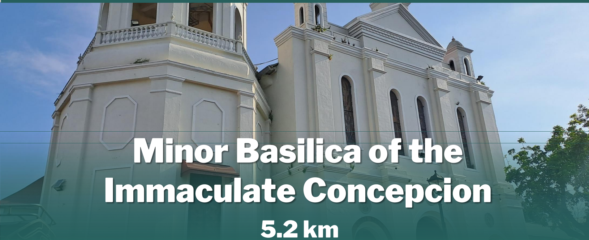
Minor Basilica of the Immaculate Concepcion 5.2 km