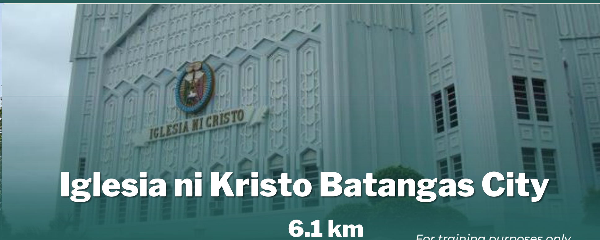
Iglesia ni Kristo Batangas City 6.1 km