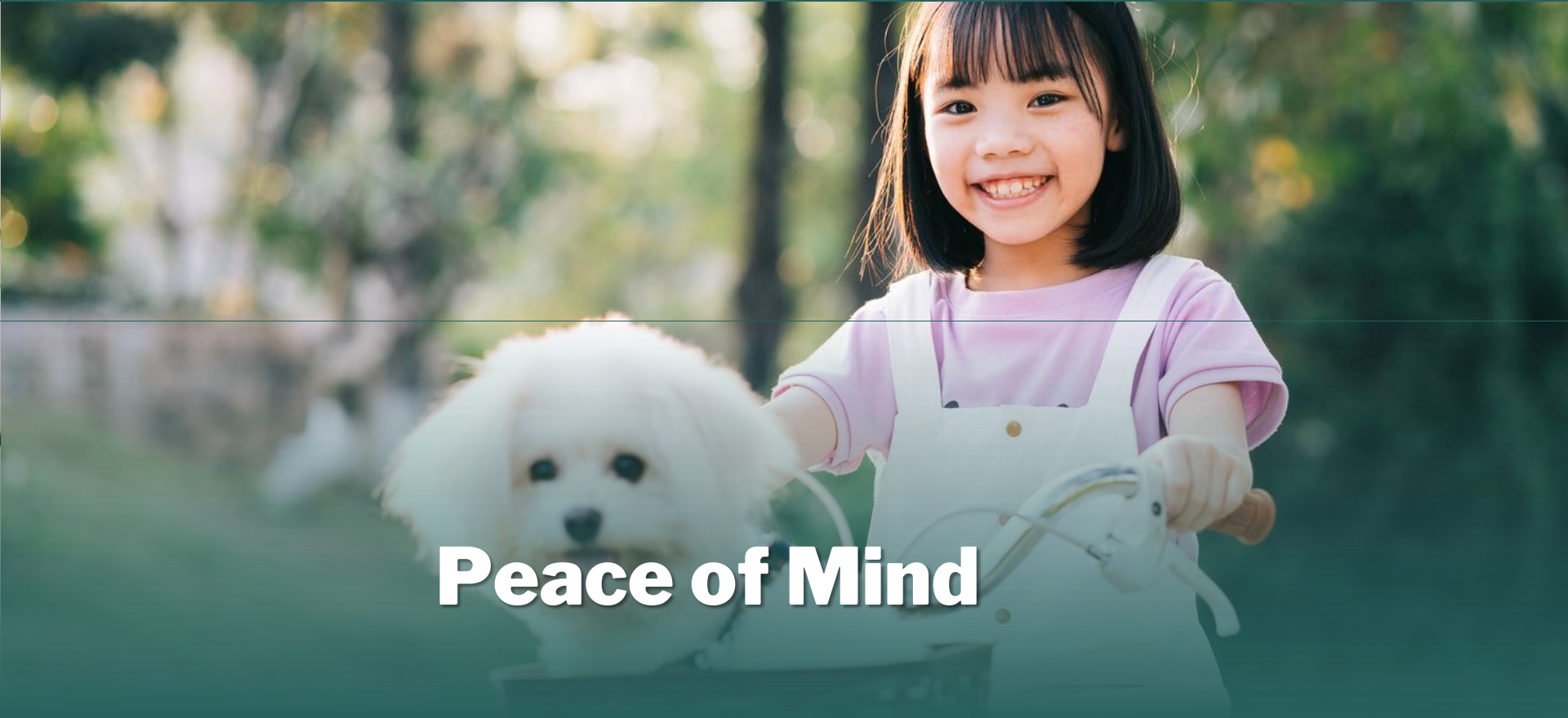
Peace of Mind