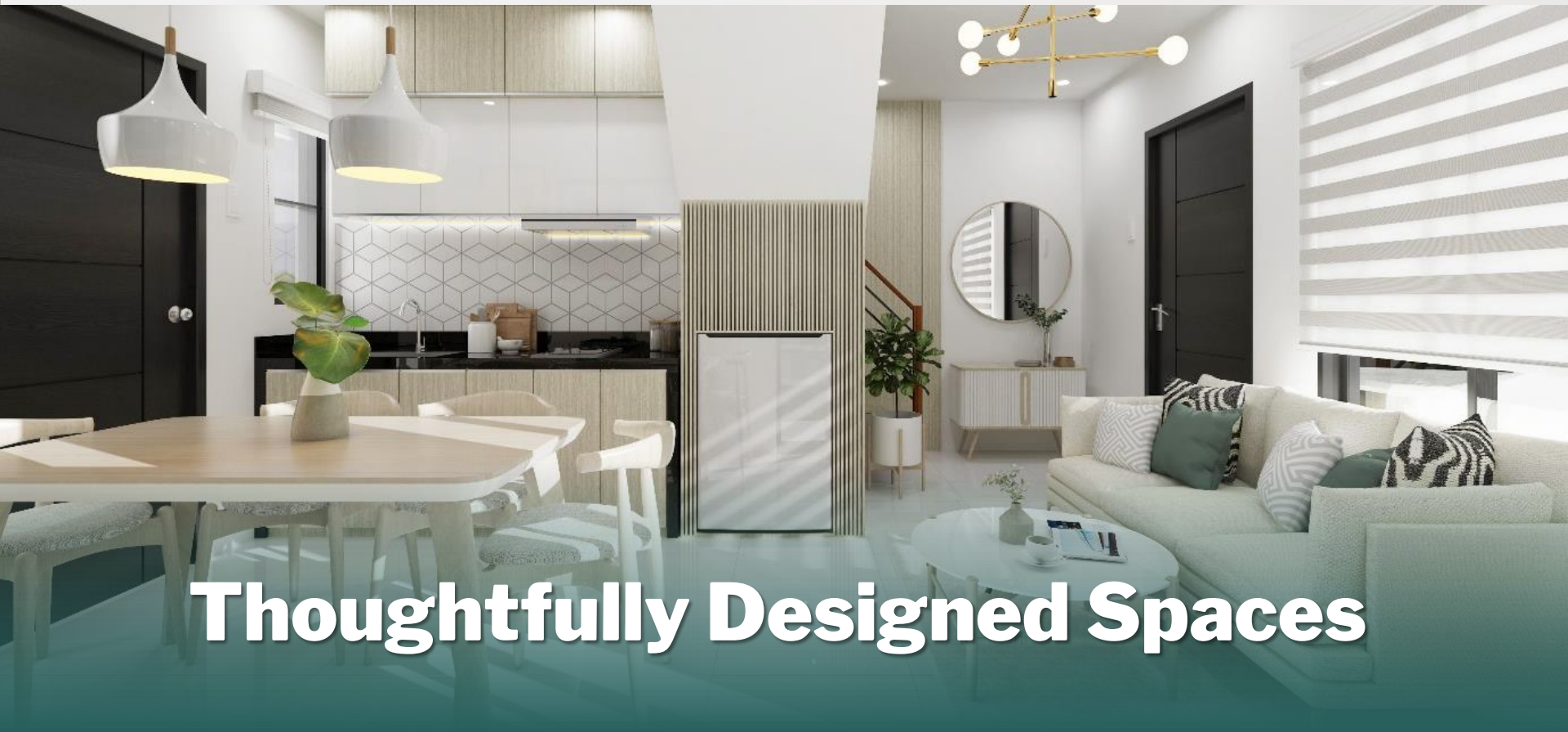
Thoughtfully Designed Spaces