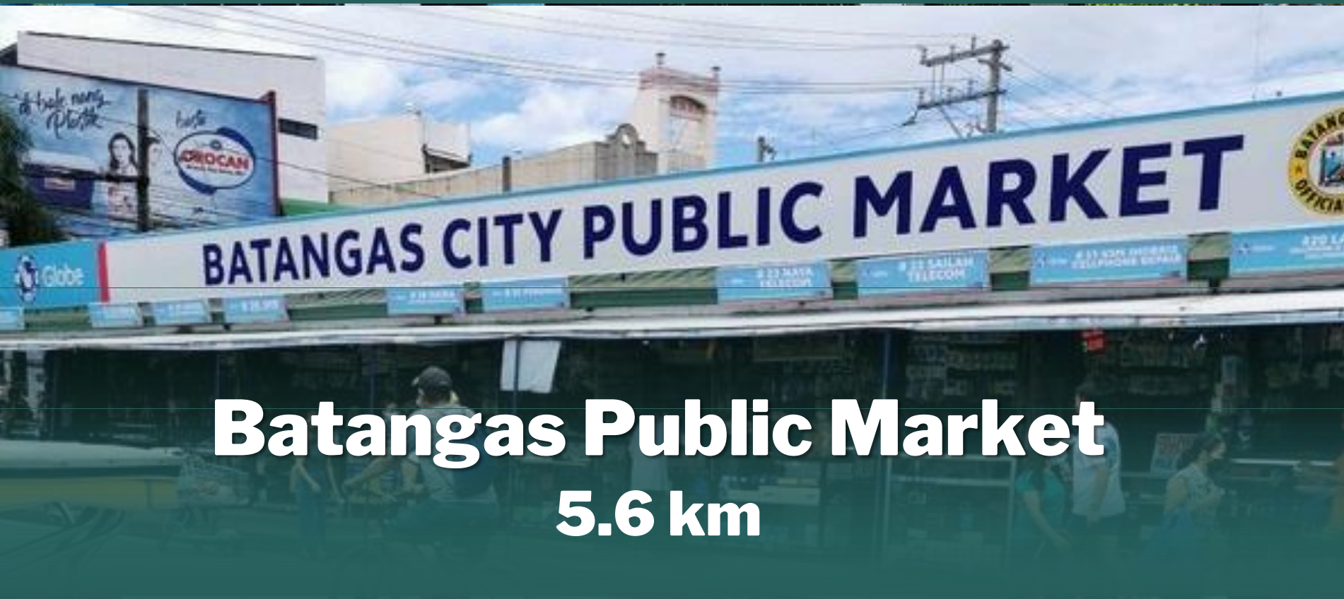
Batangas Public Market 5.6 km