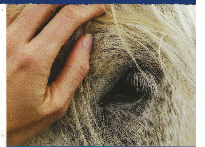
Enriching the lives of animals and their people.