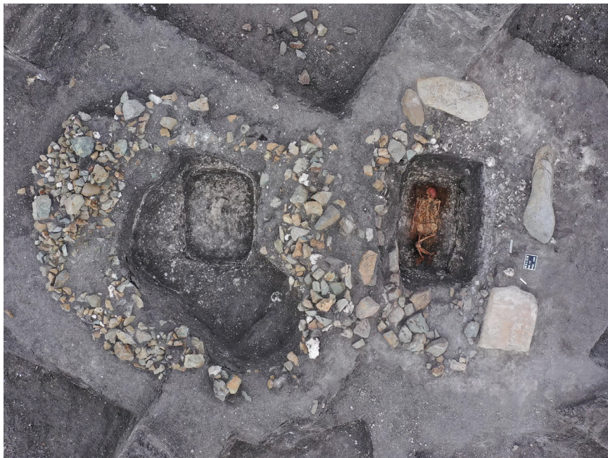
Grave of a probable horse rider discovered in Malomirovo, Bulgaria. He was a man of 65-75 years old when he died.