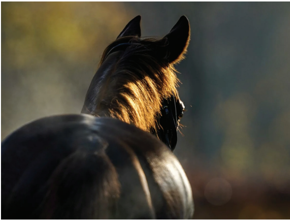
A new study of ancient human remains finds that horse riding may have been common as early as 4,500 to 5,000 years ago.

March 3, 2023 • 2:17 PM ET Heard on All Things Considered Nell Greenfieldboyce