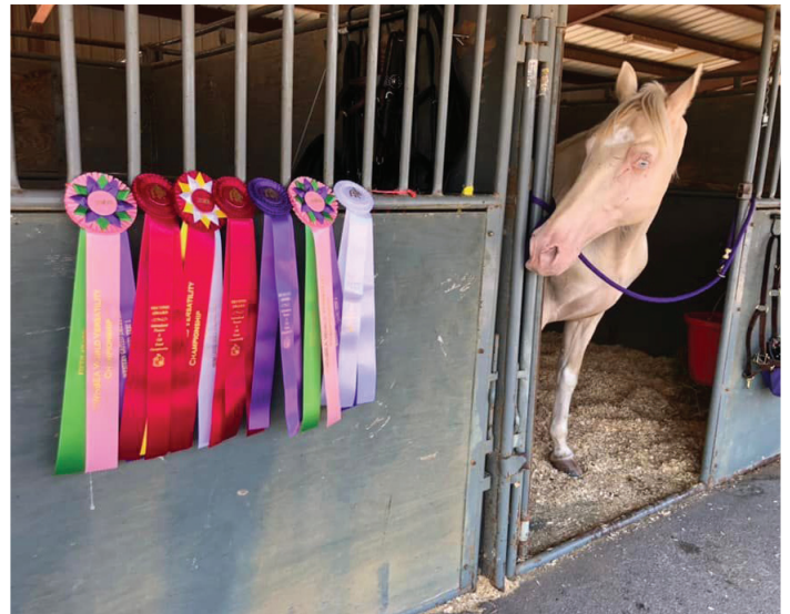
Congratulations to AJ the trail pony! His scores were consistently 62% to 67%. Both judges scoring him almost the same.