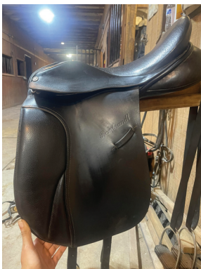
17" adjustable Rembrandt dressage saddle. $600 obo