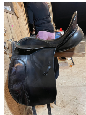
18" adjustable Rembrandt dressage saddle. $500 obo