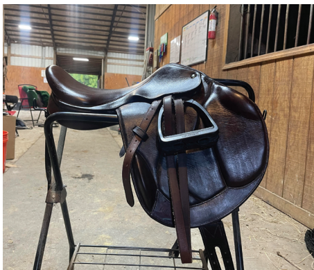
18" M. Toulouse Monoflap Event Saddle with Genesis System (adjustable tree). $1000 obo

Contact: Sloan Adams, email: sloanliza@gmail.com or call: 865-258-8373