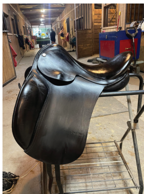
17.5" Pro-Seat dressage saddle, Medium-Wide tree. $700 obo