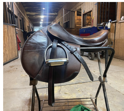
17.5" M. Toulouse Close Contact with Genesis System (adjustable tree). $900 obo