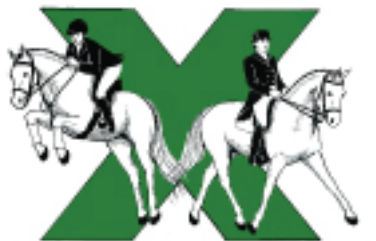
Region 3 USDF GMO #0319

CDCTS is a USDF Group Member Organization that caters to dressage and combined training (eventing) riders and enthusiasts in the Knoxville area and throughout East Tennessee.