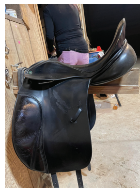
18" adjustable Rembrandt dressage saddle. $500 obo