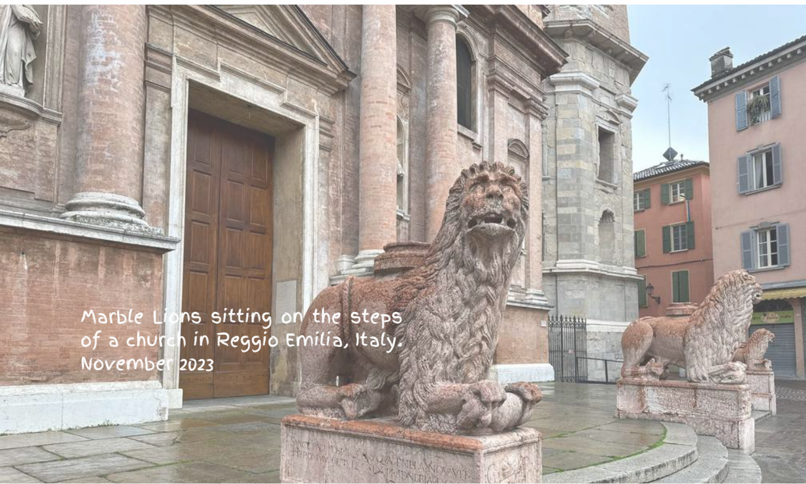
Marble Lions sitting on the steps of a church in Reggio Emilia, Italy. November 2023

As a Reggio-inspired preschool, I was grateful to be part of the North America Study Group that visited Reggio Emilia in November 2023 during the 60th birthday of the First Municipal Preschool in Reggio Emilia, Preschool Robinson. I experienced firsthand how loving a Reggio Emilia community, school, and intentional environments are for the children, families, and teachers. There is no cookie-cutter mold or blueprint to being Reggio; it is a mindset inspired by the Reggio Emilia schools about the children and the community of adults who are responsible for the children.