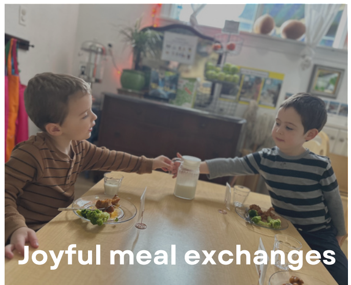
Joyful meal exchanges