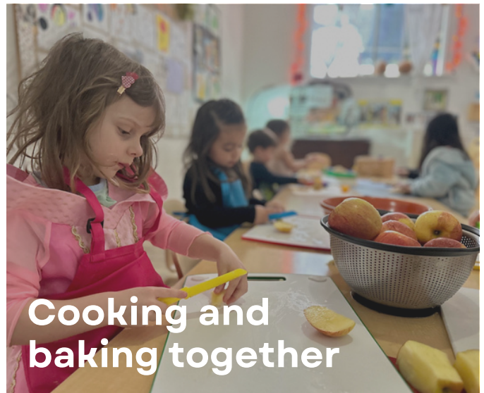
Cooking and baking together