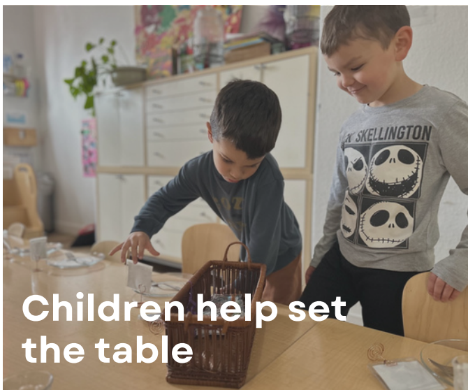
Children help set the table