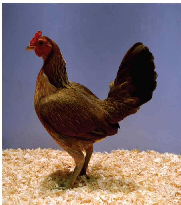
Reserve Champion Bird in Show, Champion Large Fowl, Champion Division 1 Large, Black Red D/L Hen, Tim Polley.