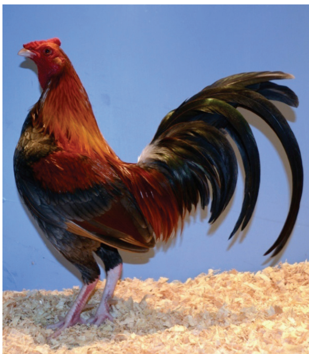
Champion Bird in Show, Champion Bantam, Champion Division 1 Bantam, Blue Red L/L Cock, Davis Gamefowl Stud.