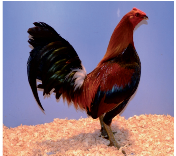
Champion Large Division 1 Cock, Davis Game Fowl Stud.