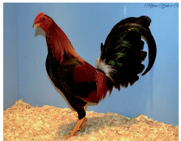
Champion Large Division 3 Cockerel, T. Polley.