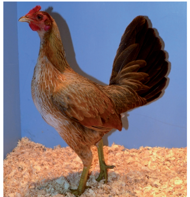
Champion Large Division 3 Pullet, C&C White.