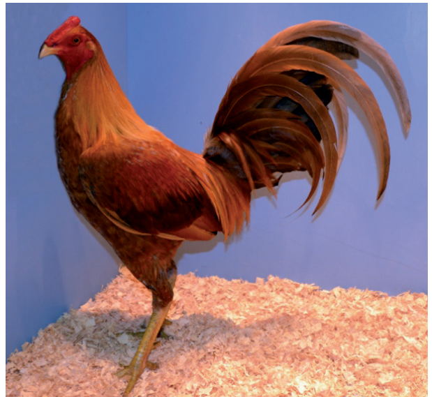
Champion Large Division 3 Cock, C. Sneesby.