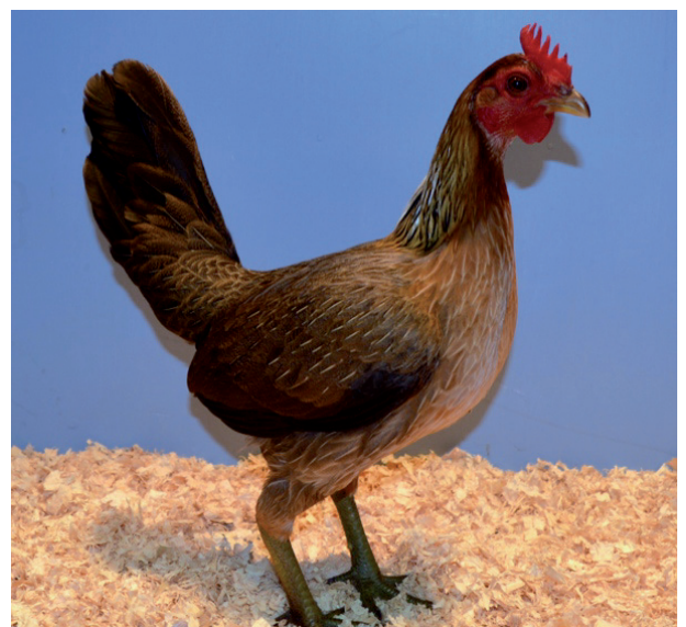
Champion Large Division 1 Pullet, C&C White.