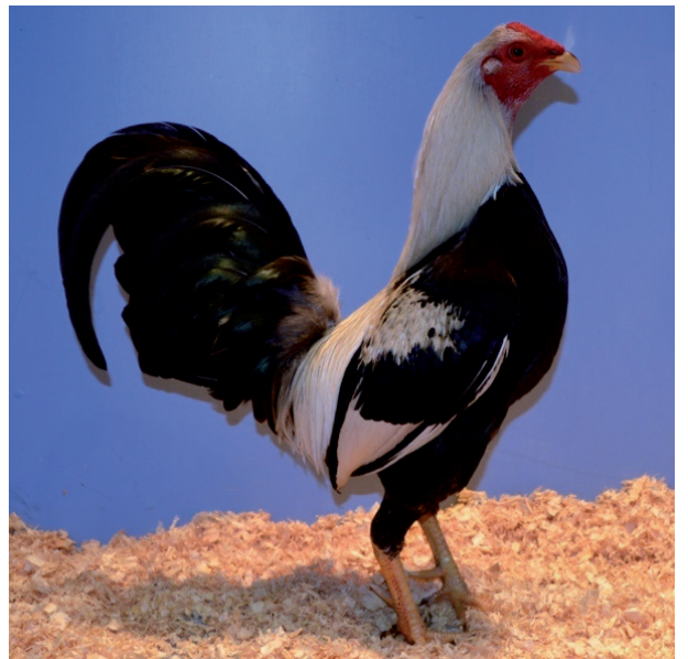
Champion Large Division 2 Cock, N. Ironside.