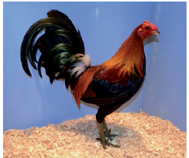
Champion Large Division 1 Cockerel, C&C White.