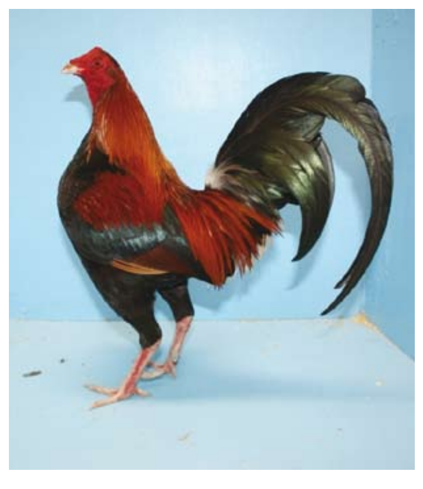
ABOVE: Reserve Champion Division 1 Bantam, The Gnome.