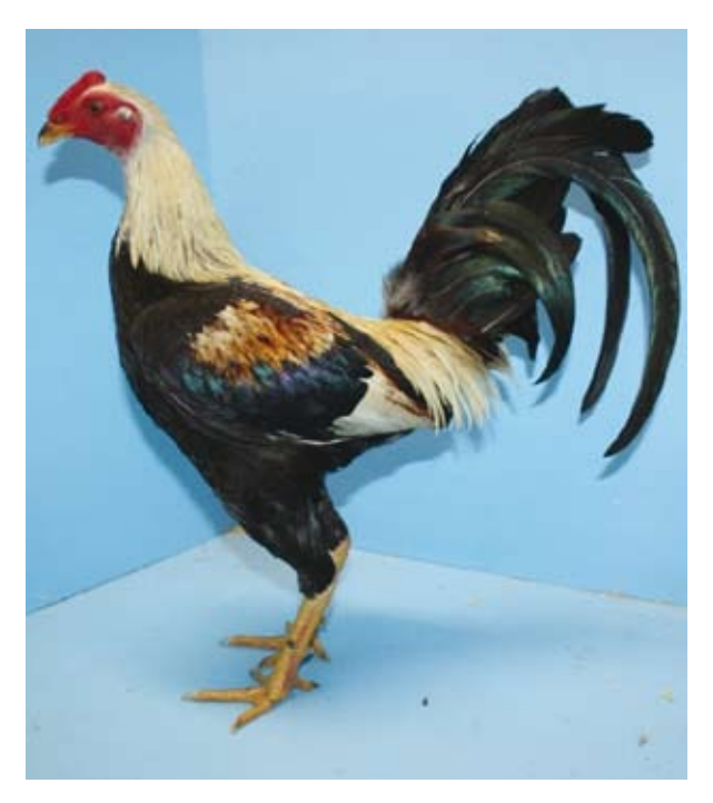
ABOVE: Reserve Champion Division 2 Large, Champion Division 2 Large Cockerel, Scamp & Hughes.