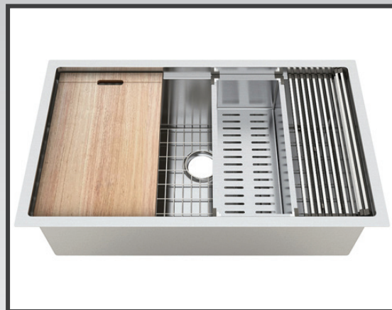
B1851 32 x 19 x 10" (33" cabinet)