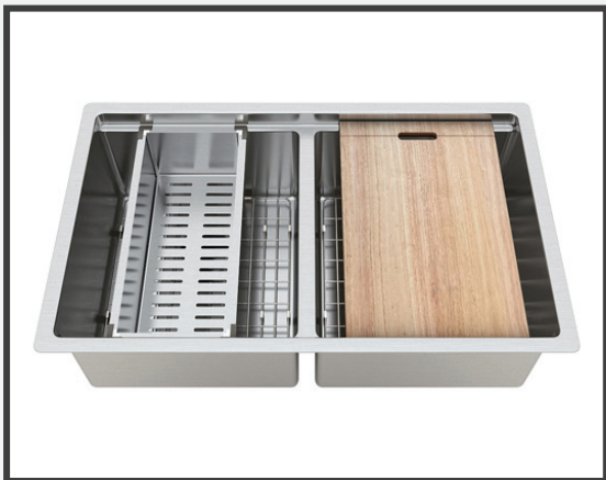
B1860 31 1/8 x 19 x 9" (33" cabinet)