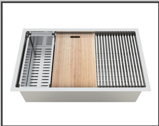
B1850 28 x 19 x 9" (30" cabinet)