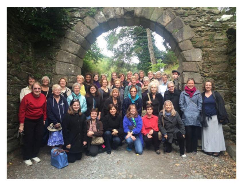
The entire alumnae choir at the Glendalough Ecclesiastical Settlement.