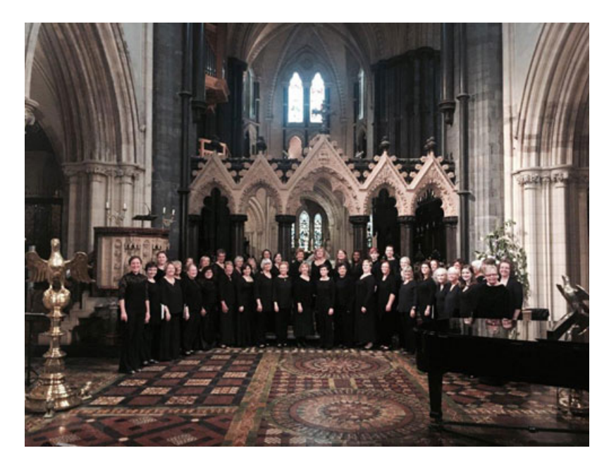
The full alumnae choir in Christ Church Cathedral.