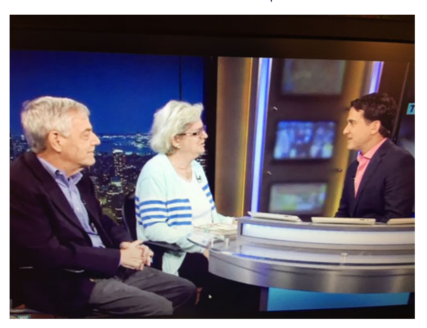
Taping the Time-Warner New York One Cable news "On Call" program in their television studio in the Chelsea Market, Manhattan.