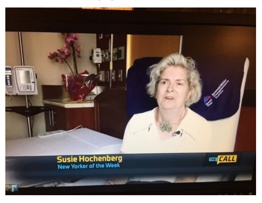
Visiting in a patient's room