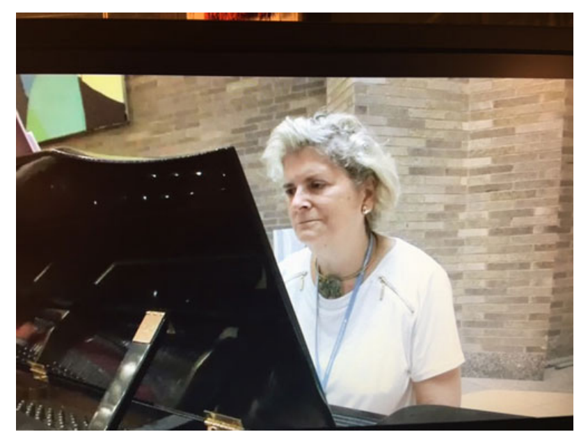
Playing piano in the Mount Sinai Hospital lobby