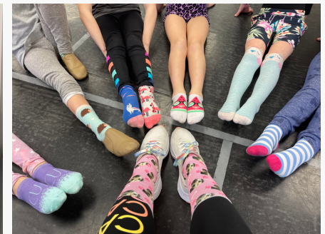
Clockwise from top left: Teacher/Twin Day; Crazy Sock Day St. Patrick's Day; Disney Day