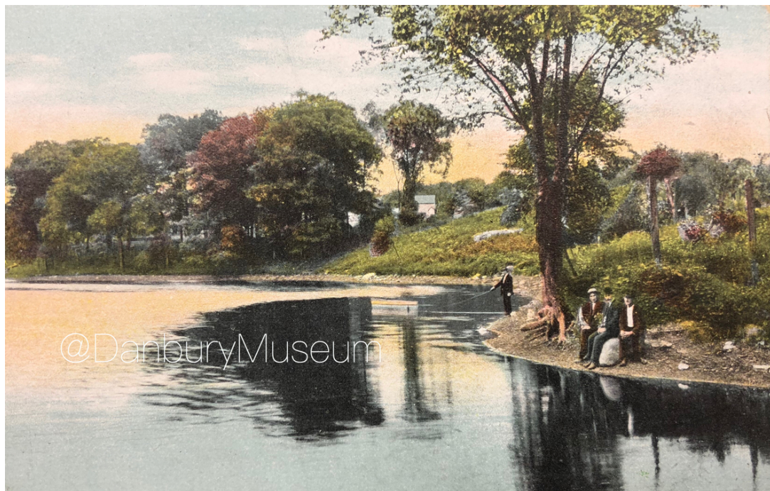
Bucolic Oil Mill Pond