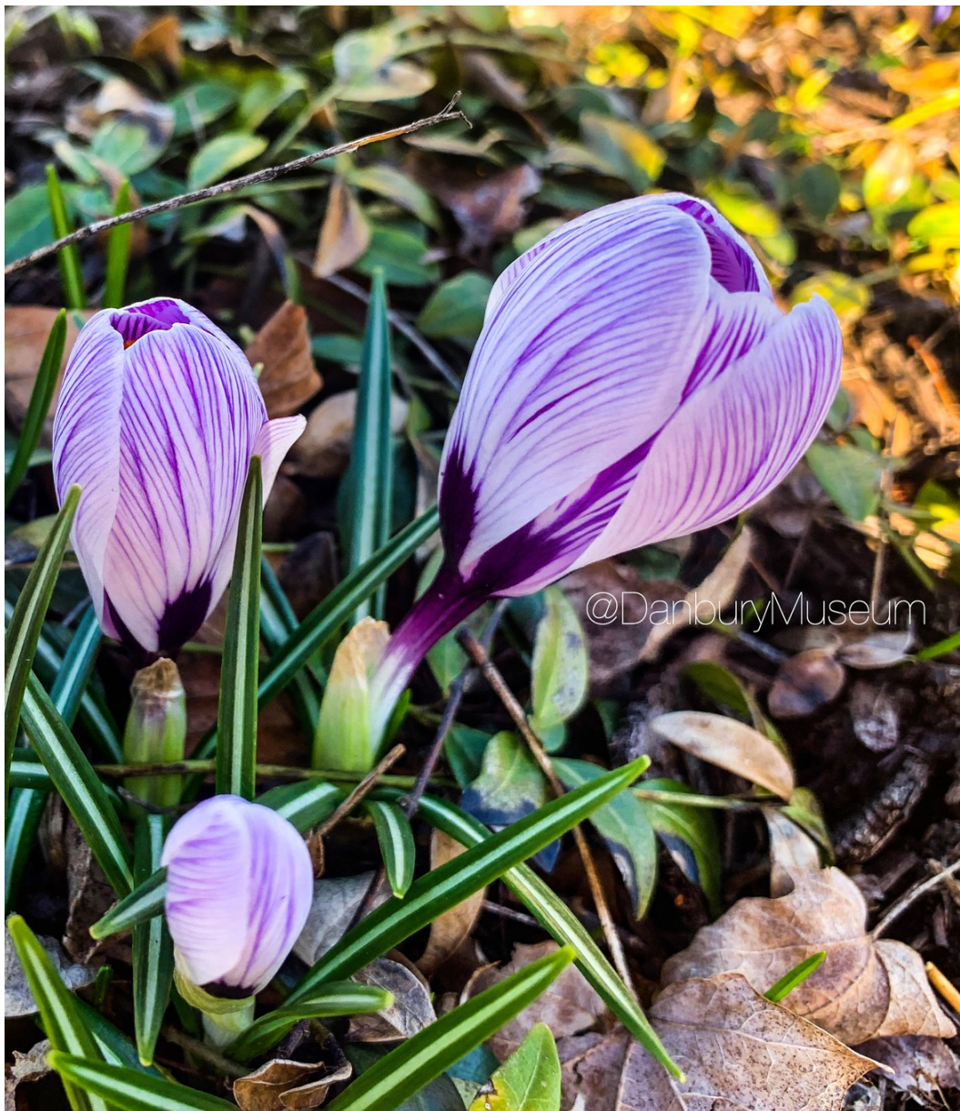
Danbury Museum garden, spring 2019