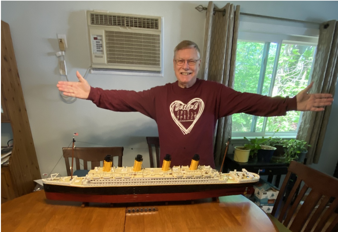
The author with his Titanic LEGO model!