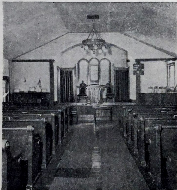
Interior of Church