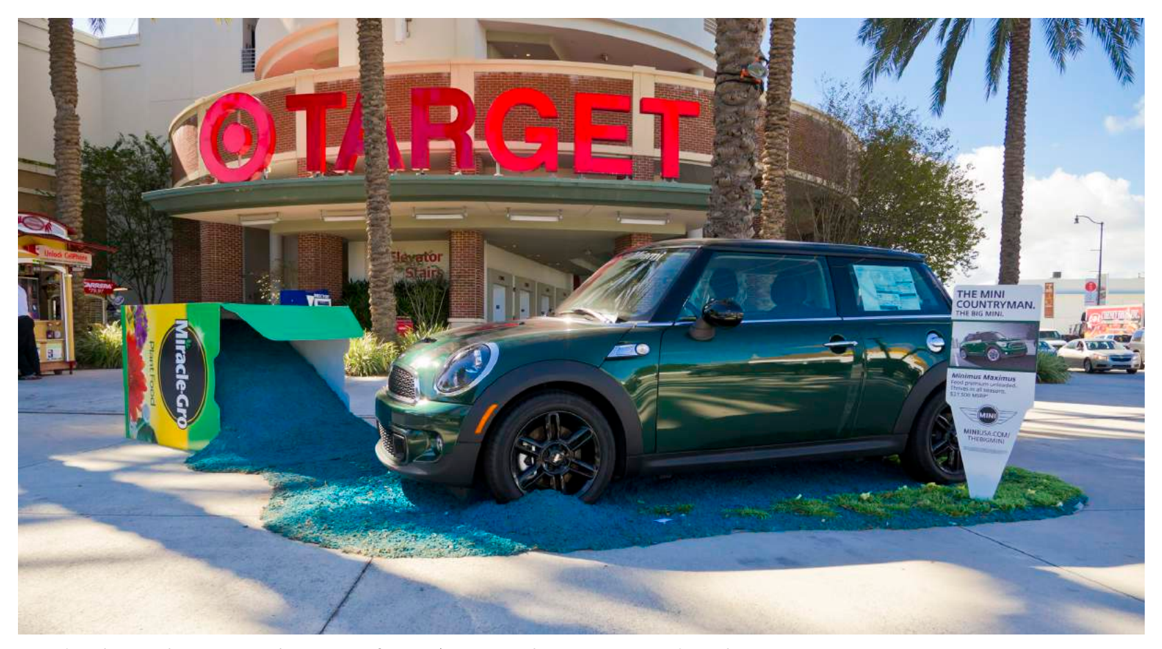
*Display above is by Target at the corner of NE 36^{th} Street and Buena Vista Boulevard.