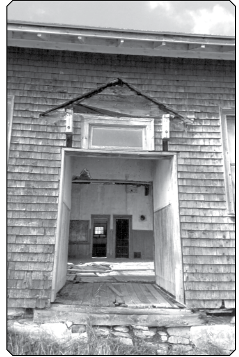
The entrance to Longfellow School.