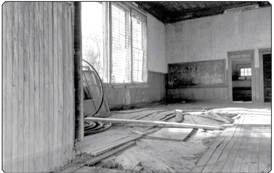
Sunlight sheds some rays on the sturdy and bumpy floor. Notice the wall with the black board and tin ceiling. If only those walls could talk!