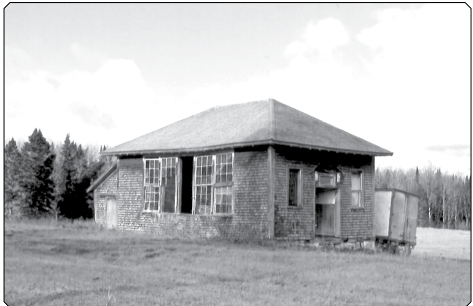
Longfellow School as it looked on November 8, 2018.