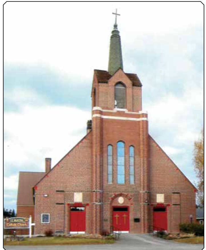
St. Agatha Catholic Church after the completion of the project