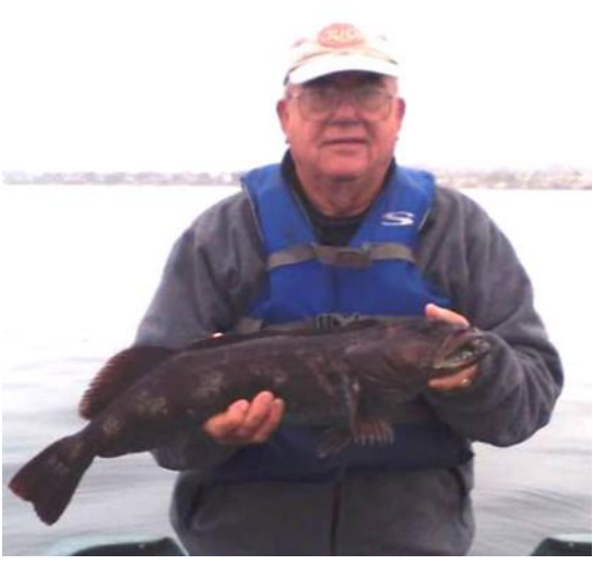
The prez with a fly caught ling cod from a previous Santa Cruz outing

While the target is kelp bass, don't expect to see any kelp. You'll be fishing in water 30 feet deep over rocky high spots. You won't have to fight casting into a maze of vegetation. If you find that the bite has fallen off, you've probably drifted away from the pinnacles,