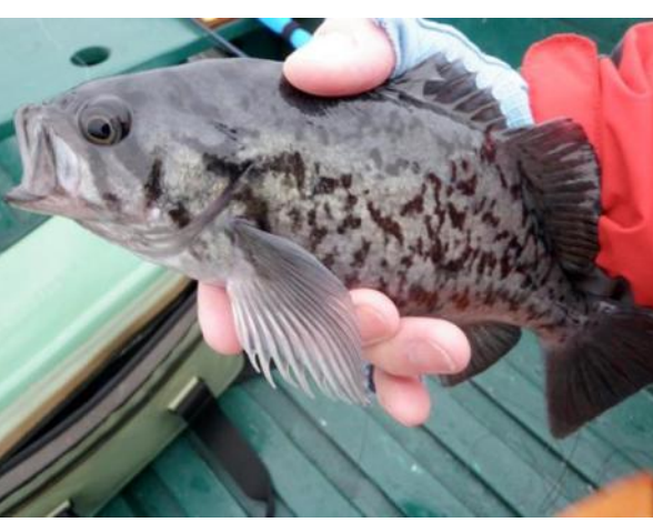
A "Blue" rockfish, one of several varieties that you might catch.

beat the check-in rush. Once everyone is checked in, we'll pick out a restaurant order a few brewskies and a seafood