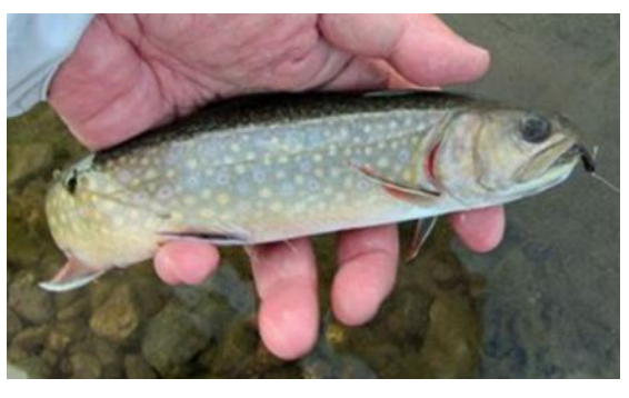
with white leading markings. They

.Brook trout are actually a char and native to the East Coast. Populations in its native waters are declining but they are doing well in western high elevation streams and lakes. Its breeding coloration is quite striking...orange bellies and red ventral paired fins