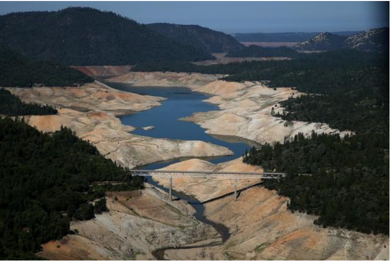
Lake Oroville this August

lic comment period to follow. In our Delta Fly Fishing Newsletter, I have pointed out the many flaws in the BDCP and how it would destroy the Delta not restore it would and decimate our fisheries, infrastructure, agriculture, and economy. Evidentially, many other groups from many diverse backgrounds agreed. In a press release from CSPA released August 29, over 4,500 pages from counties, cities, and water agencies were strongly negative of the BDCP. They felt the BDCP would adversely affect their interest. This followed close to 2,000 pages of criticism from environmental