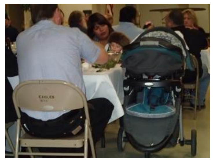
A junior fly fisher, mom and dad.