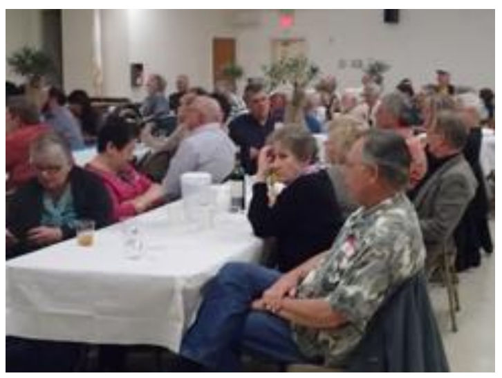
Al, "Lifetime Achievement? Can't be me. I'm not that old!"