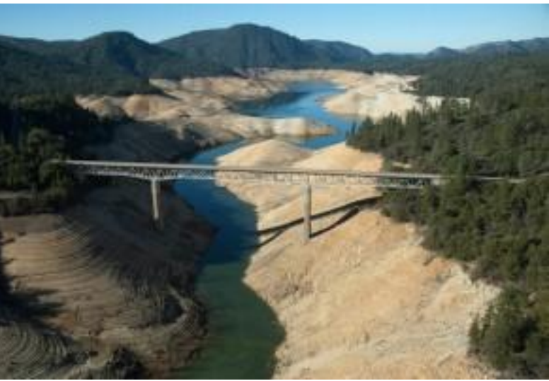
run, which can be done if Upper Lake Orville or what's left of it.

In California, we now have a new term to describe this technique. The term is "astroturfing." The purpose of astroturfing is to make an organization appear to be one thing when their purpose is exactly the opposite. A astroturf group we need to become aware of is the Latino Water Coalition. Ostensibly, they try to present themselves as an waterenvironmental group. They are not! I became involved with them four years ago when working on the Human Right to Water Bill in Sacramento. There are