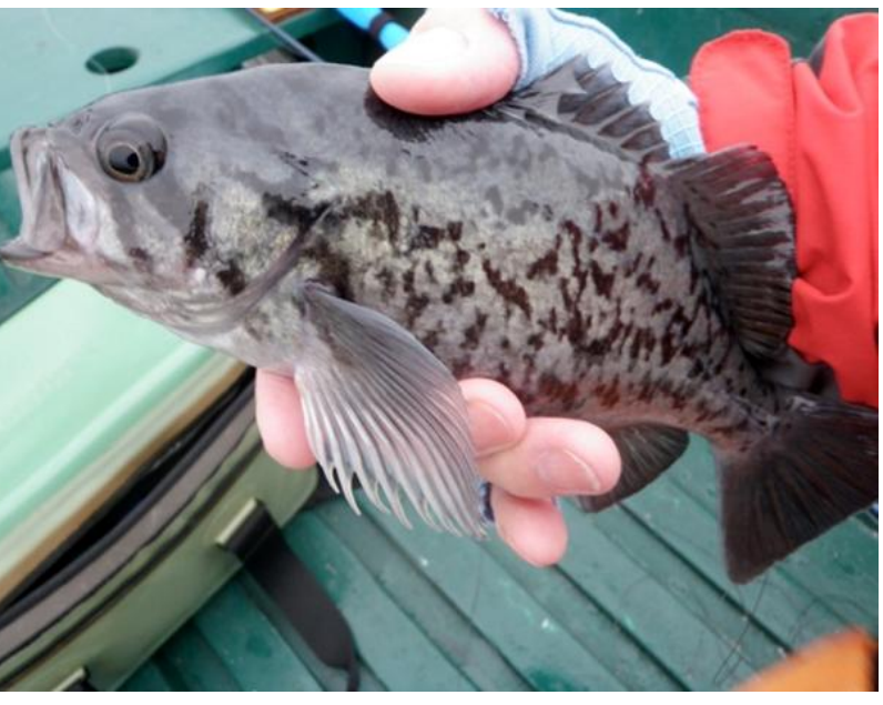
A Santa Cruz kelp bass.

cover and are exposed. If you tie into one of these fish you'll have your hands full, especially on that seven weight. White sea bass are as tough as stripers and will peel line off your reel faster than a bone