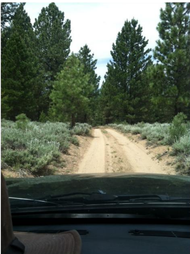
On the trail to Cow Cove.