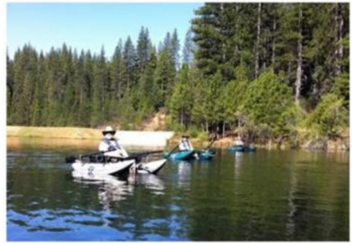
Larry Schmidt in the foreground, Ron Forbes behind. Both looking for the big fish prize, 2012.

some of the popular choices. Personal floatation devices are a must. No fish-finders are allowed during the contest. The California Department of Fish and Wildlife and the local businesses usually keep this lake well stocked and fly fishing can be excellent through mid-June. Late spring carpenter ant falls and Callibaetis hatches can produce exceptional dry fly fishing. Other species that can be fished during the summer and fall include largemouth bass, bluegill, crappie, and common carp.