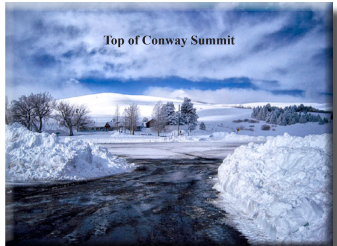
Top of Conway Summit