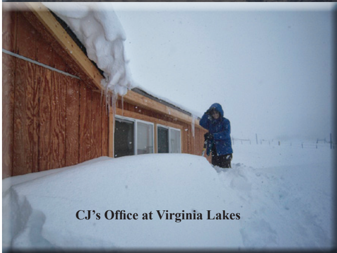
CJ's Office at Virginia Lakes