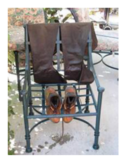
Figure 4. These patio chairs make great drying racks.

Conveniently, the five gallon bucket fits right under the faucet in my bathtub and even hangs on to the shower button. Empty the bucket and carry the gear back outside in the bucket to dry as shown in Figure 4. Maybe the bucket will keep you from dripping water throughout the house.