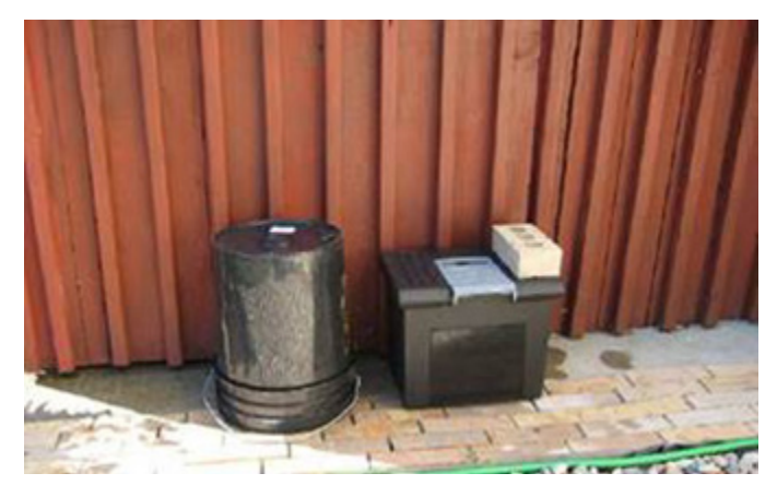
Figure 2. Disinfection Setup stored when not in use.

hands without gloves. The bricks are simply used to weight down the gear in the bleach solution since boots and some waders like to float up and may not stay submerged in solution.