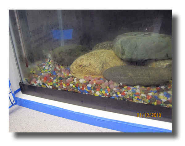
Eyed Chinook salmon eggs