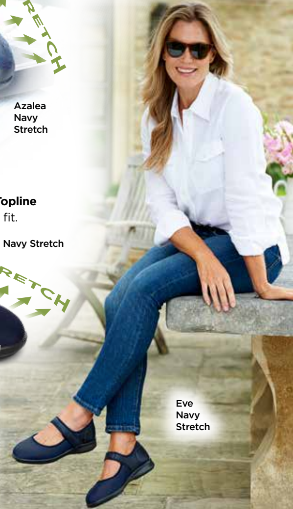
Eve Navy Stretch

Back Stiffener built in to heel gives increased support.