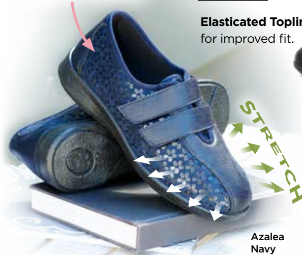
Azalea Navy Stretch