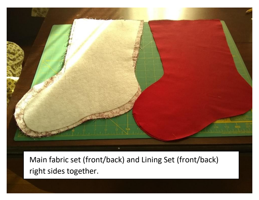
Step 4 – Place the lining/inner fabric stocking RIGHT SIDES TOGETHER matching edges.