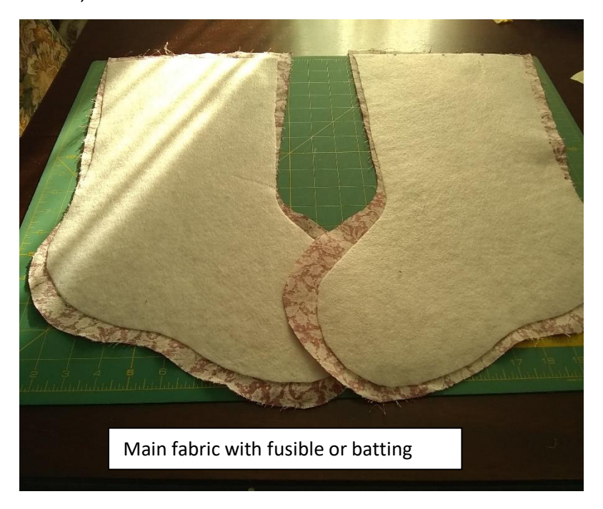
Step 3 – Place the main/outer fabric stocking RIGHT SIDES TOGETHER matching edges (Fleece/batting will be facing you).