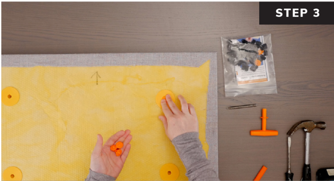
Insert reusable marking plugs into the Snap-On anchors.