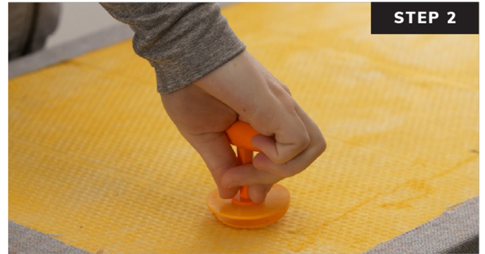
Screw Rotofast Snap-On Anchors into back of the panel using the Rotofast driver tool. Do not over-tighten.