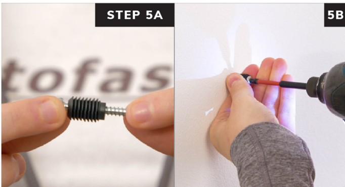
Screw ratchets to wall at marked locations. Flat end of ratchet goes against the wall, curved end faces out.

#8 screws recommended *Hollow wall anchors are recommended for drywall applications.