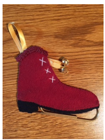
November Ornament Workshop "Ice Skate"