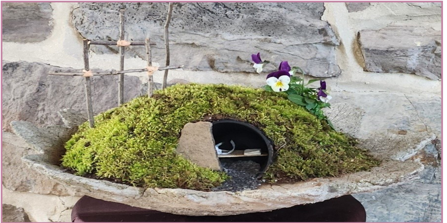
The Empty Tomb by Jenny Waybright