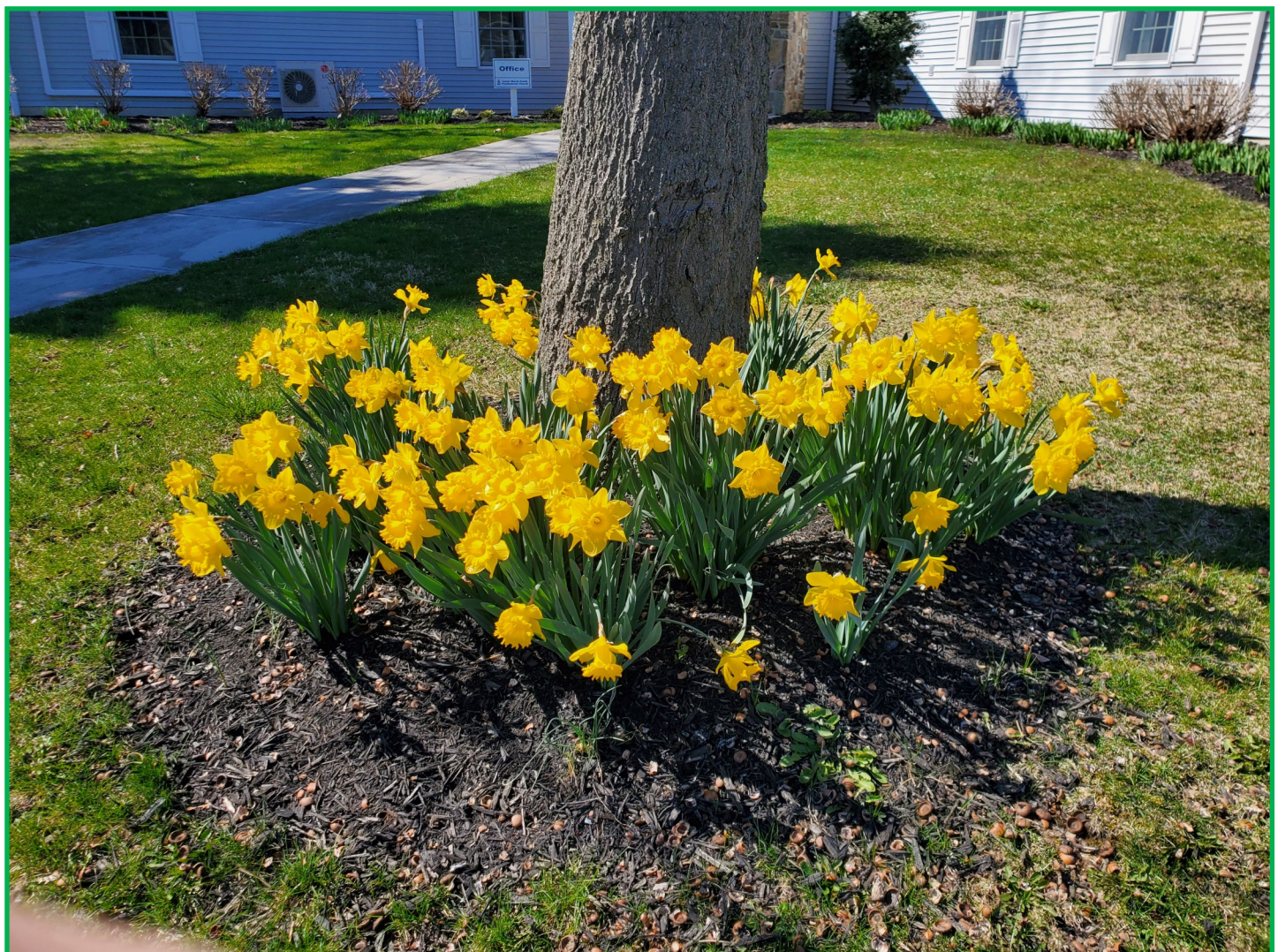
Daffodils in the area of Fellowship Hall