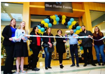
Blue Flame Events Retail Store

The spring has been busy with grand opening/ribbon cutting ceremonies! Below are pictures from April events and the next ceremony will take place this Sunday, May 5 th for Stone Lake Winery at All Aspects at the Barn at 1:00pm! Come out to these events to support your fellow Chamber members!