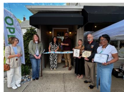
Meadow & the Moon Retail Store