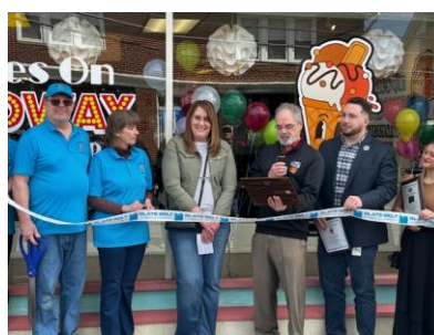
Sundaes on Broadway