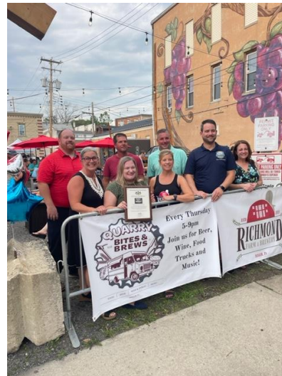
Quarry Bites & Brews, a food truck and beverage event, is held each Thursday evening in downtown Bangor.