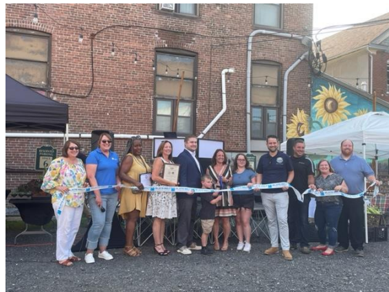
The Bangor Farmers' Market takes place downtown Bangor on Wednesday evenings.