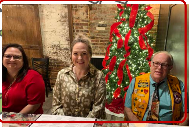
Booneville Lions Club Christmas Party