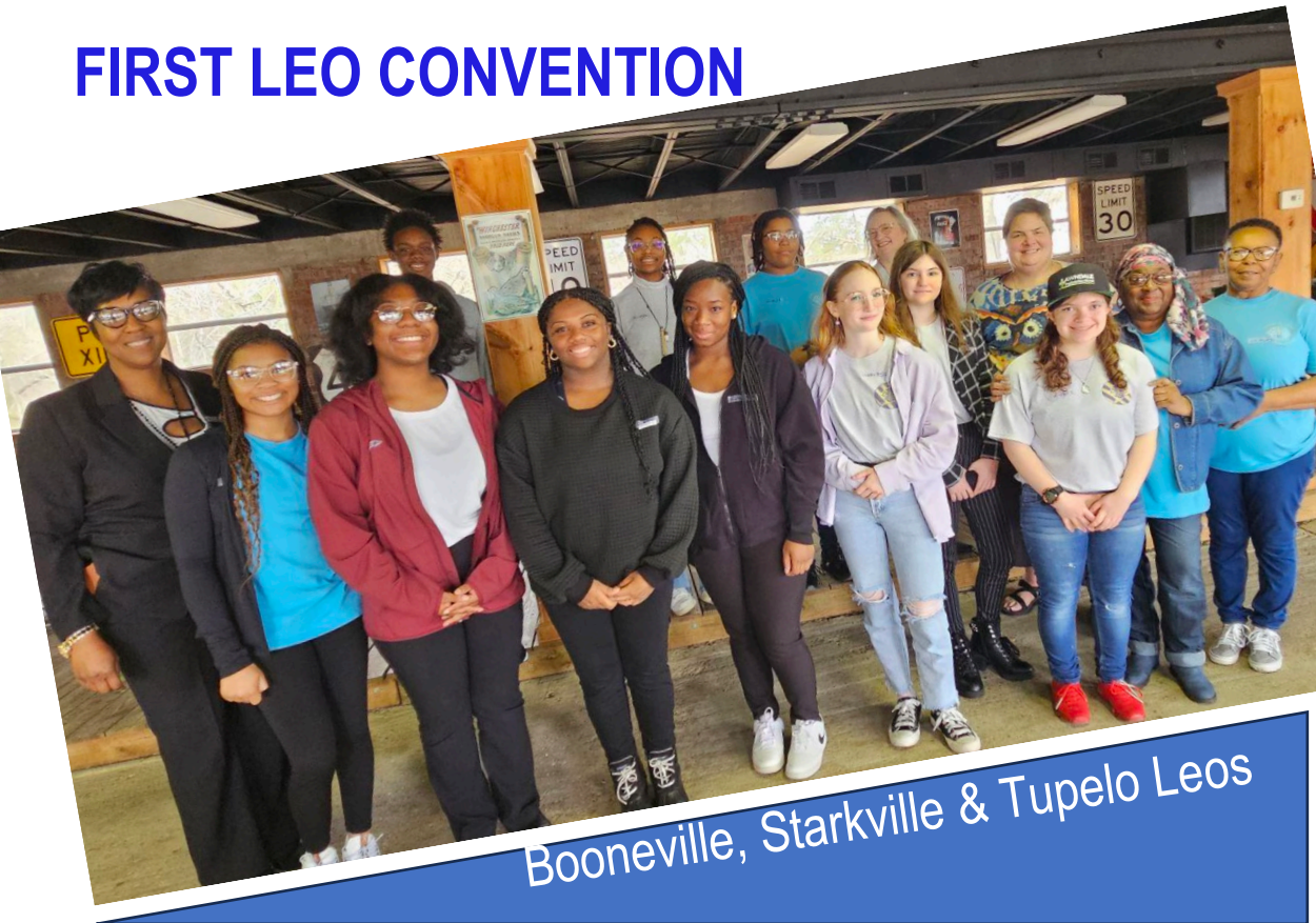
Booneville, Starkville & Tupelo Leos