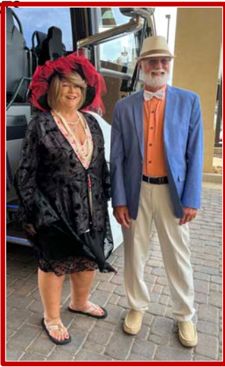
Lots of folks grabbed their best Derby Day attire to board the tour bus of Columbus.